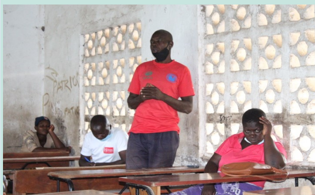
7 Participant asking a question