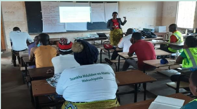
1. Presentation on contraceptive in progress