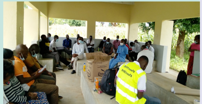
2. Participants deliberating