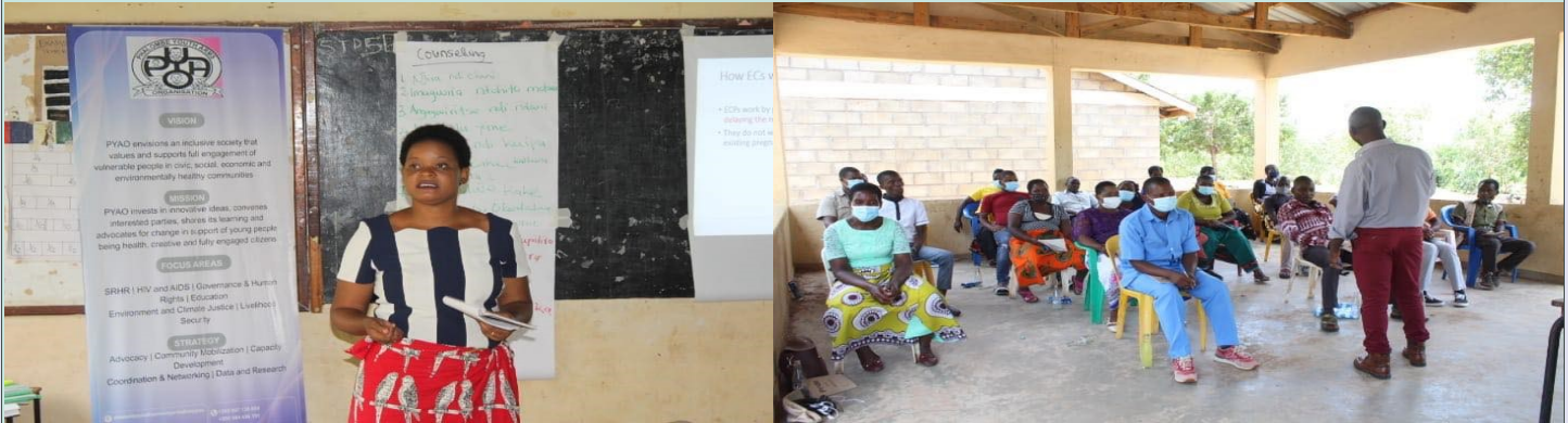
Facilitators on making their presentations in different venues

Stakeholders responsible for distributing family planning methods in Phalombe have been trained on the use of the emergency contraceptive pills to promote proper usage in the district which registered 3,000 teenage pregnancies last year.