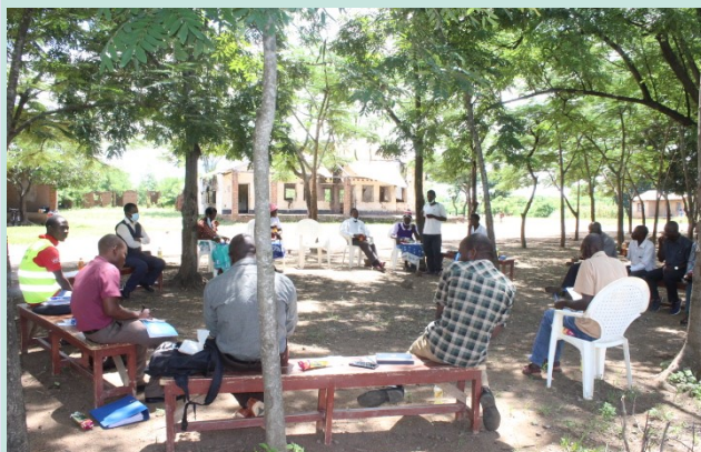
5 Community meeting at TA Mkhumba ground