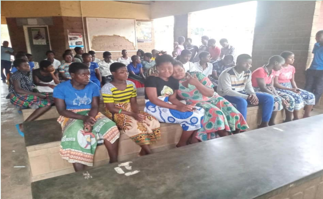
Some of the youths of Phalombe

“Look at that amount, what can a sector like health do with that amount in improving YFHS and family planning delivery?”