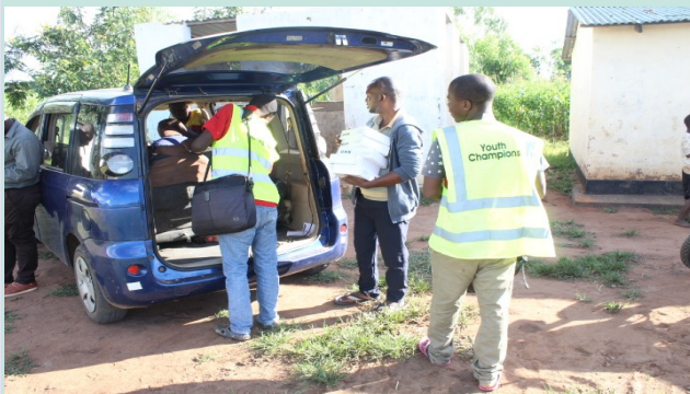
3. PYAO team arriving in T/A Kaledzera