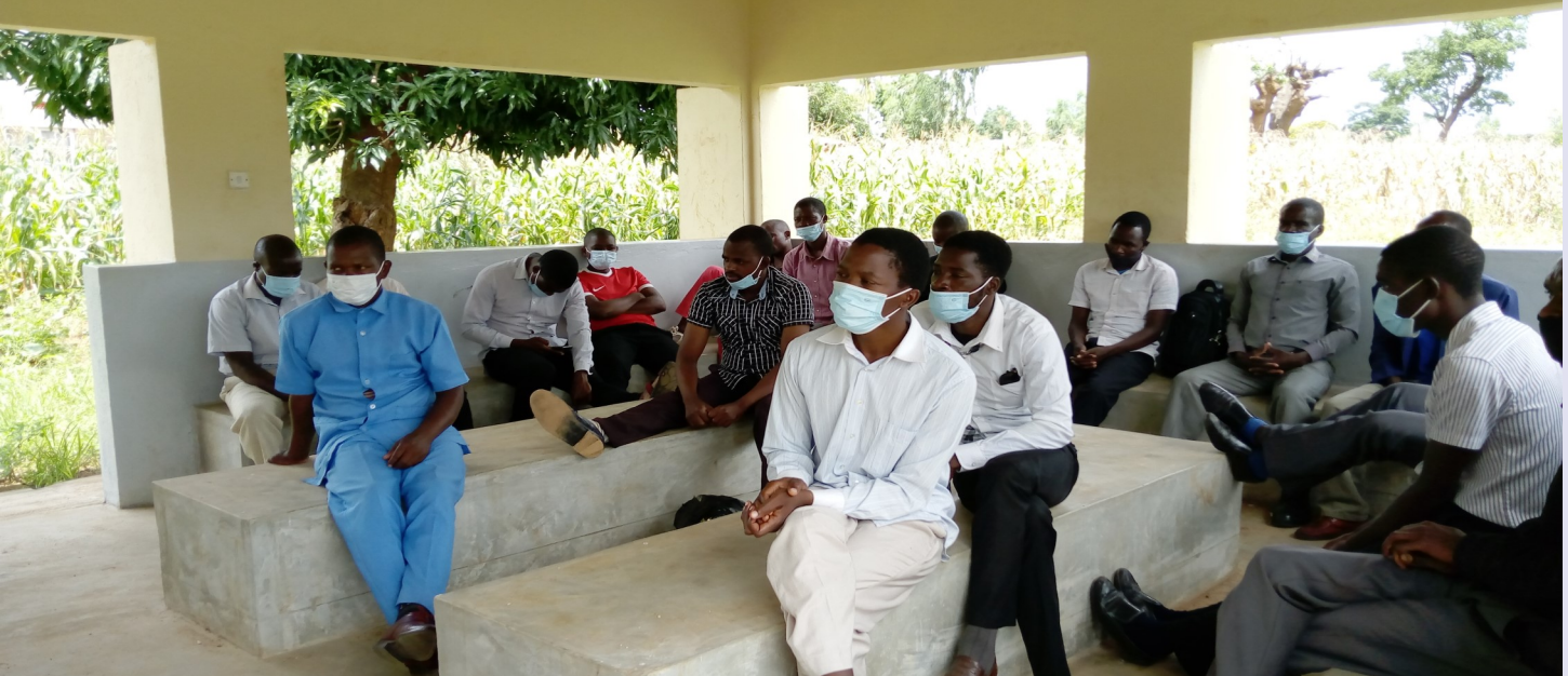
Part of the participants comprised on Teachers and health workers having their orientations at Nambazo Health Centre in traditional authority Chiwalo

Patrons and Matrons of different primary schools in Phalombe district have been urged to be in forefront of encouraging learners to joining Edzi toto clubs so that they should be tapping information to do with prevention of HIV /AIDS.