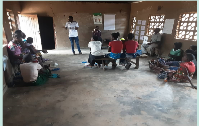
Part of the training